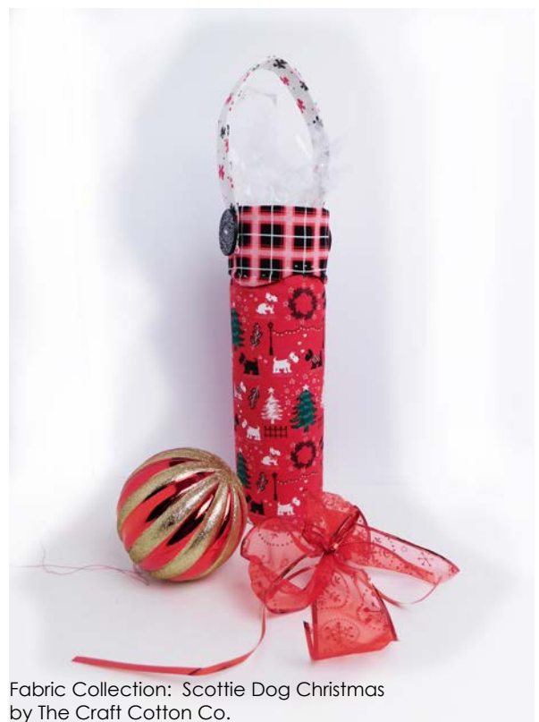
Fabric Collection: Scottie Dog Christmas by The Craft Cotton Co.

RS - Right Side WS - Wrong Side RST - Right Sides Together WST - Wrong Sides Together Baste - sew using your longest stitch Scant 1/4" - slightly less than 1/4" Edgestitch - sew 1/8" from edge